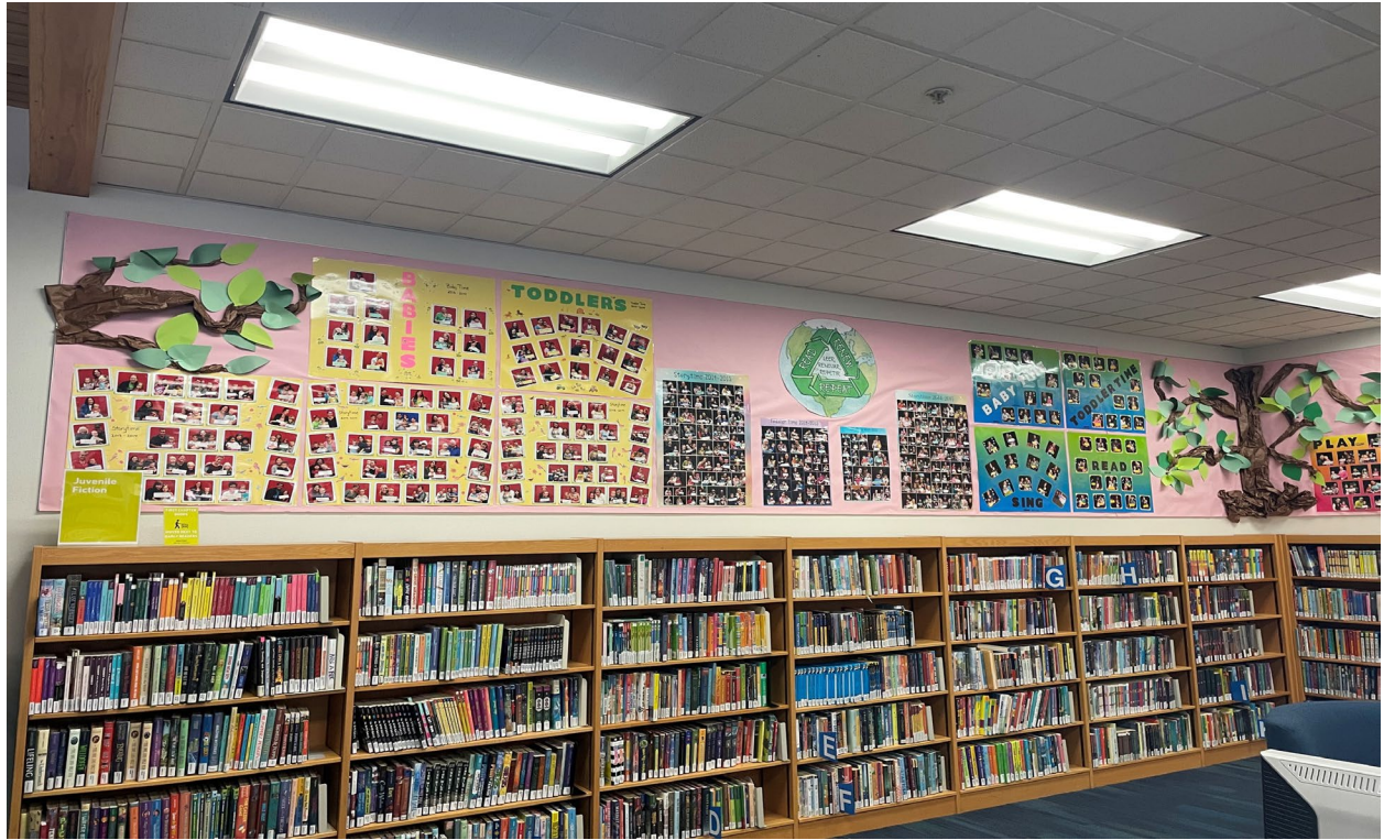
4) South Wall – 25' x 4' (left of restroom doors)