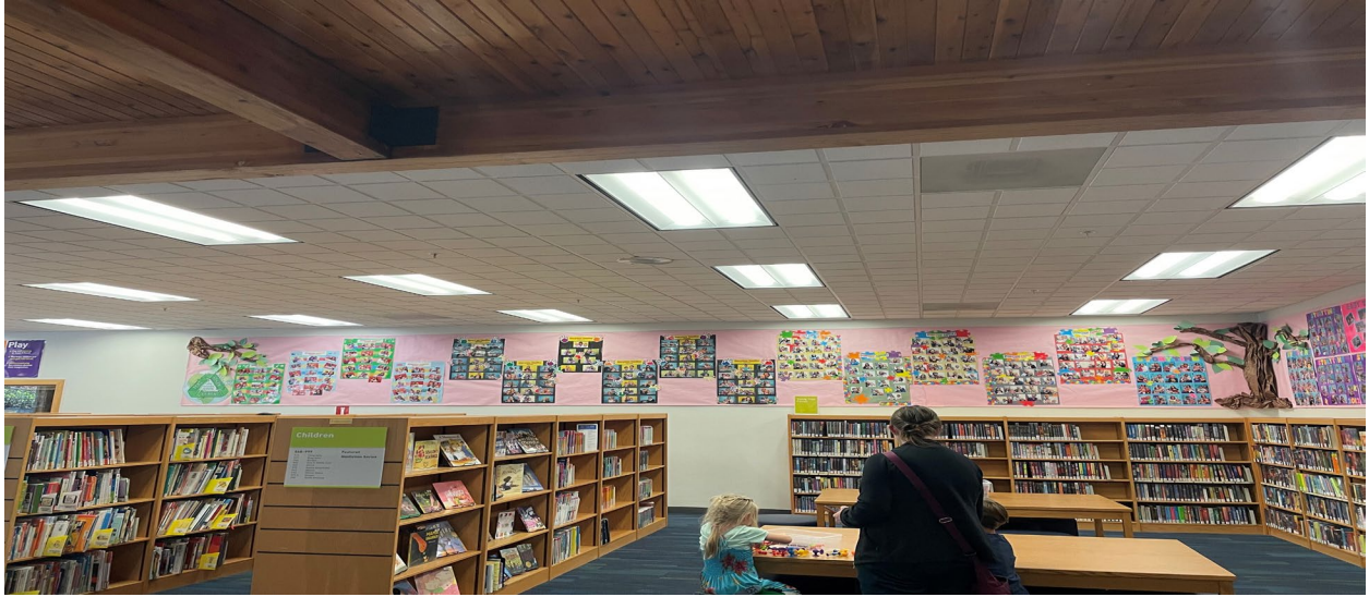
2) North East Wall – 22' x 4' (at left of entrance when standing in and looking out to main lobby)