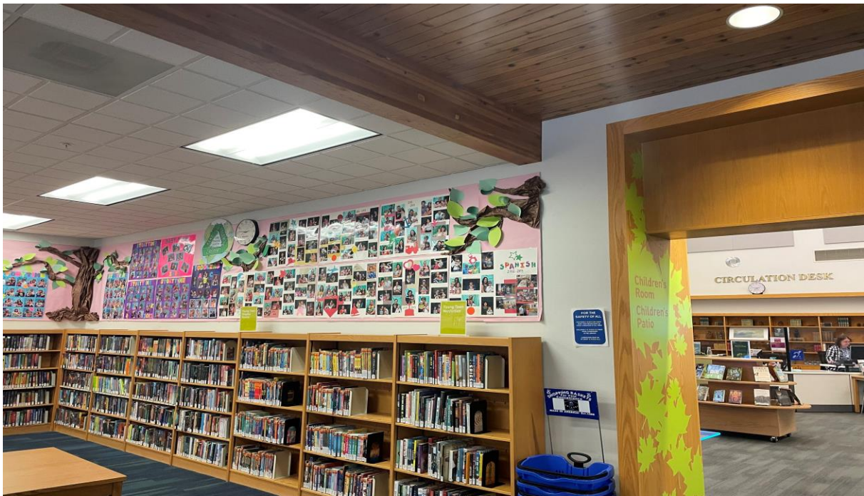
3) South East Wall – 22' x 4' (at right of entrance when standing in and looking out to main lobby)