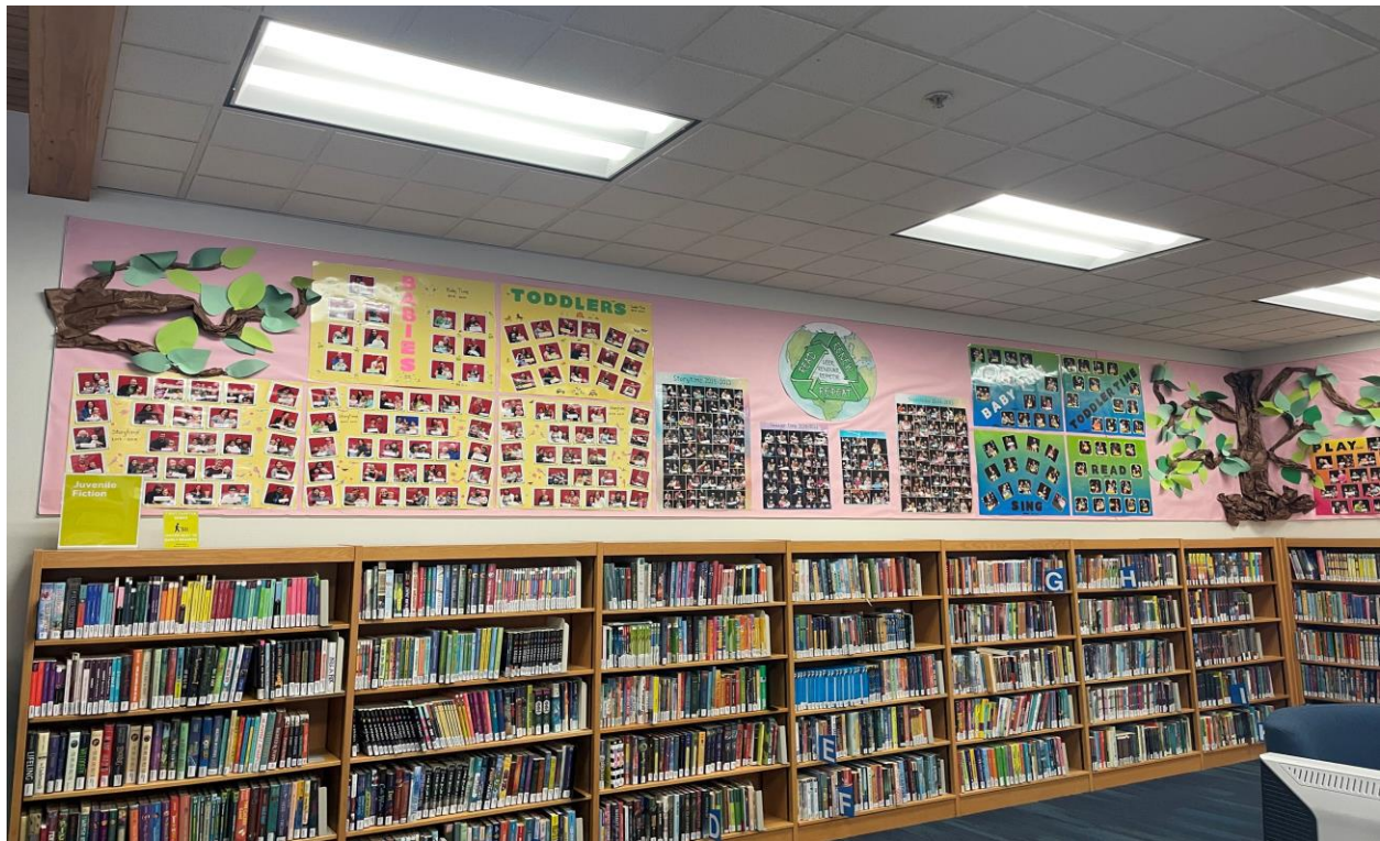
4) South Wall – 25' x 4' (left of restroom doors)