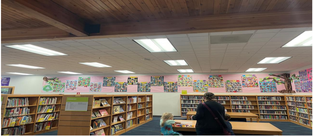
2) North East Wall – 22' x 4' (at left of entrance when standing in and looking out to main lobby)