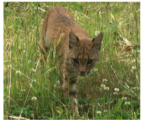
Bobcat ( Lynx rufus )