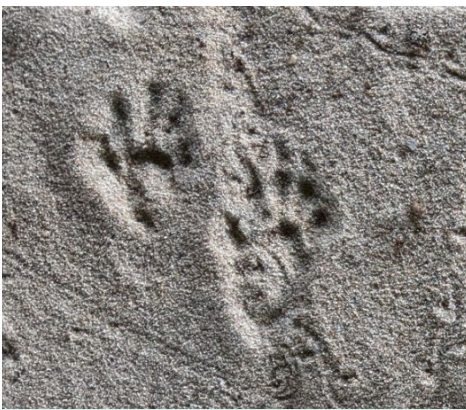
Raccoon ( Procyon lotor )

Wildlife monitoring helps us understand which species share our landscape and how well conservation efforts are supporting them. Today, this work is being carried out through efforts across Wilsonville and includes remote wildlife camera monitoring and sand tracking.