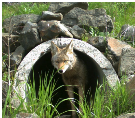
Coyote ( Canis latrans )