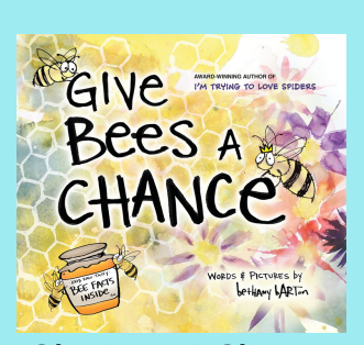
Give Bees A Chance by Bethany Barton

This sweet, yet informative text offers peaceful art and incredible infographics that kids can relate to. One of two charming informational picture books about large mammals; the other is titled The Polar Bear .