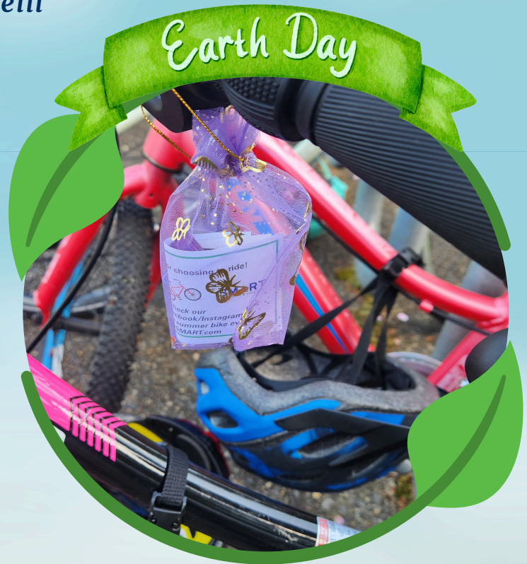
Boeckman Earth Day - Bike to School SMART Bike Fairy goodie Bag

Later in the month, SMART joined regional partners and advocates at the Oregon Active Transportation Summit. This annual event brings together people from across the state who are passionate about walking, biking, and transit. SMART staff participated in workshops and discussions focused on building more connected, safe, and accessible transportation systems for everyone. The event provided valuable insight into building more equitable and sustainable transportation systems, while reinforcing SMART's role in shaping Oregon's active transportation future.