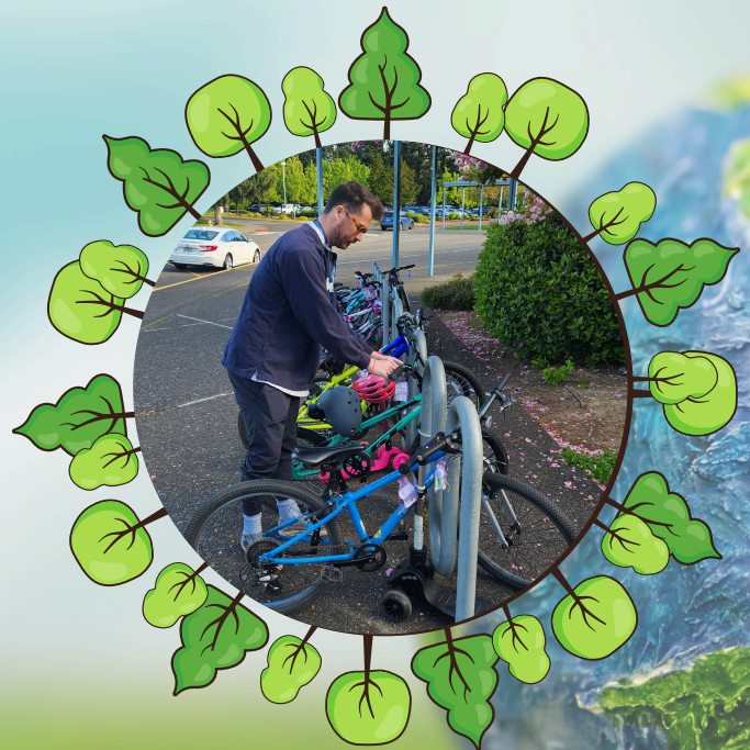
Boeckman Earth day event, Placing Fairy goodie bags