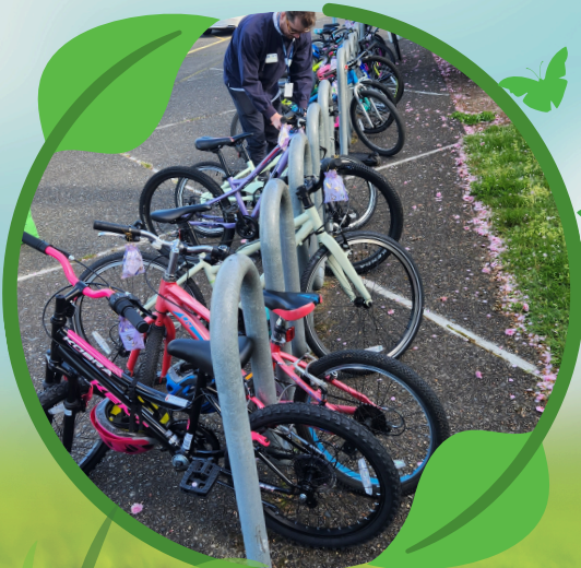
Full bike rack at Boeckman Creek Primary.