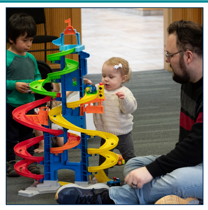
Young patrons enjoy playing with toys at a Play Group session.

Heart Strings Mandarin shared a variety of instruments, told stories, and taught some Mandarin language to the audience of young children with their parents on Mar. 29.