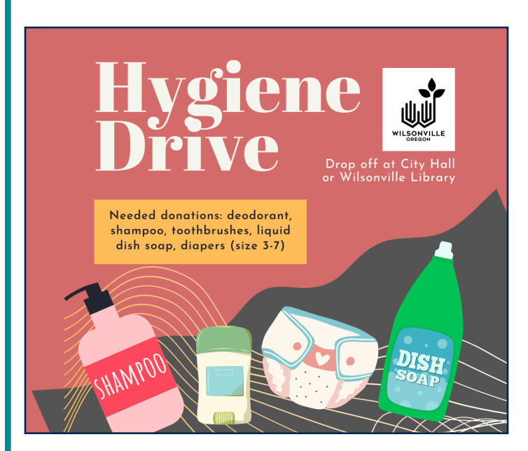
The library served as a donation site for the March Hygiene Drive.