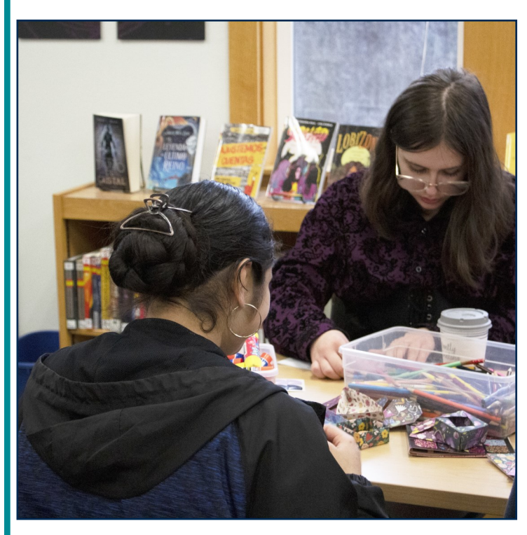
Teens got hands-on with crafts at a Teen Afterschool Drop-in Activities day.